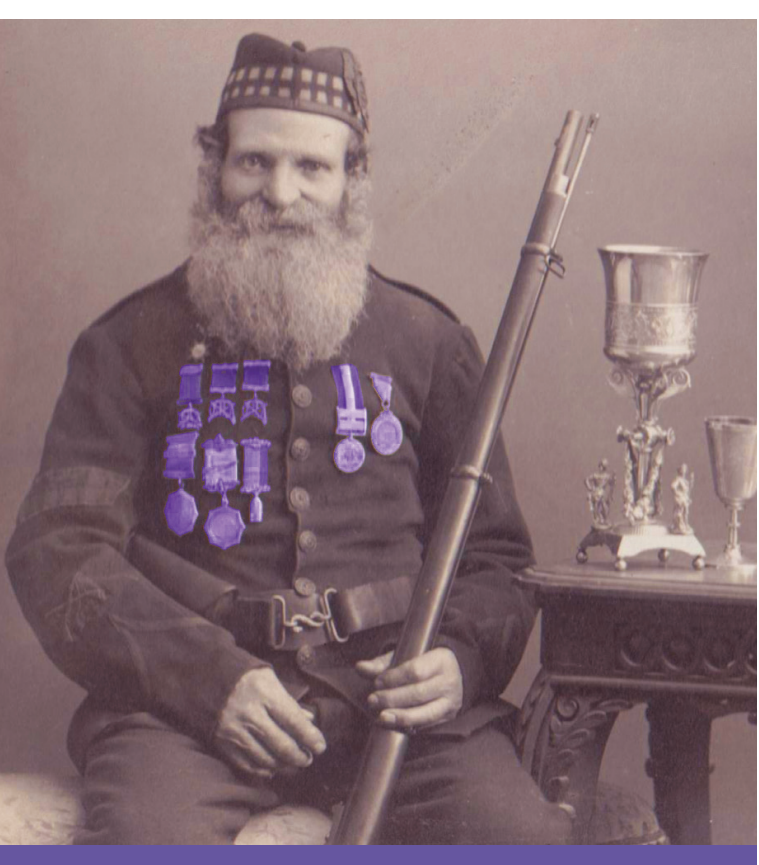
DO YOU NEED PROFESSIONAL EXPERTISE TO VERIFY A FAMILY TREE?

Here at Family Wise, we offer several different services to help clarify the situation for an inheritance, whether you have all the information at your fingertips, or just a name and a date to go on. Here are our main services, but if you feel that your needs aren't covered below, contact us for a bespoke quote.